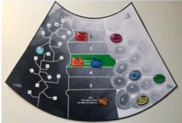
Figure 3: The Player Board representing the emotional state of the player.