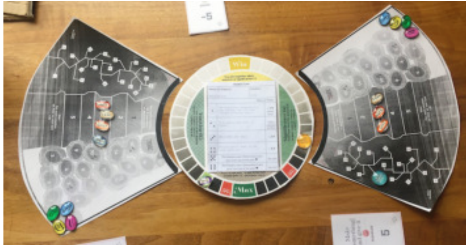
Figure 1: A two-player session of the boardgame Mind Shadows.

down to play a table-top game an implicit social experience-contract arises there between the players.