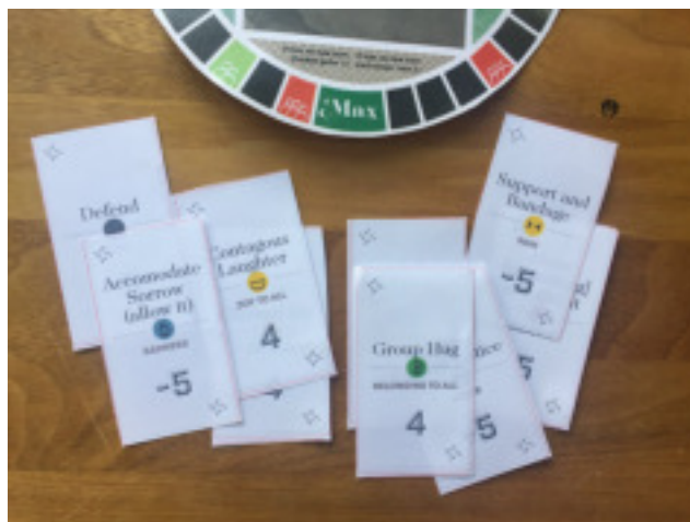
Figure 2: Superpower cards selected for co-players in the startup phase of the boardgame MindShadows.

reflective manner - a phase comparable to the sort of debriefing that is used in psychodrama. Debriefing is also a crucial component in the practice of live action role-playing, as it is in other intense settings, such as search and rescue work. In all three stages, it may prove vital to approach players experiences from an experiential perspective, drawing upon knowledge from the field of experiential psychotherapy, that traditionally uses expressive activities such as role-play, and props such as arts and crafts in order to enact emotional situations (Foulkes 1964; Mahrer 1983; Corsini 2001).