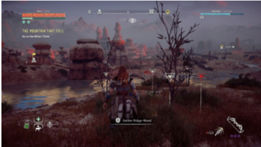
Figure 4: Horizon Zero Dawn's non-diegetic interface and the experience of striated space .

Correspondingly the smooth space focuses on the stretch of way, the distance itself. The journey is the reward which, as a momentum, fits perfectly with the involvement of players through the experience of open world landscapes as an end in itself. Deleuze and Guattari define smooth space as the space of affect, structured through a multi-sensory perception (ibid., 436f.). Regarding the computer game as audiovisual medium, the multi-sensory way of perceiving is impossible. Sensory impressions like humidity, heat or odor are compensated by hyperreal audiovisual stagings of them, including colors, luminosity, sound and other visual design like physical-based rendering. Furthermore, players turning a blind eye to maps, icons and markers of interfaces traverse the game intrinsic space as smooth space . This is the established practice of free roaming and henceforth the practice of wildness in open world games (see Figure 5).