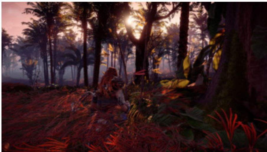
Figure 5: The experience of smooth space in Horizon Zero Dawn .

Correspondingly the smooth space focuses on the stretch of way, the distance itself. The journey is the reward which, as a momentum, fits perfectly with the involvement of players through the experience of open world landscapes as an end in itself. Deleuze and Guattari define smooth space as the space of affect, structured through a multi-sensory perception (ibid., 436f.). Regarding the computer game as audiovisual medium, the multi-sensory way of perceiving is impossible. Sensory impressions like humidity, heat or odor are compensated by hyperreal audiovisual stagings of them, including colors, luminosity, sound and other visual design like physical-based rendering. Furthermore, players turning a blind eye to maps, icons and markers of interfaces traverse the game intrinsic space as smooth space . This is the established practice of free roaming and henceforth the practice of wildness in open world games (see Figure 5).