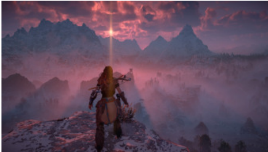
Figure 1: Prospect pacing induced by staggered horizons in Horizon Zero Dawn .

Appleton divides the landscape experience in three categories that are combinable with each other which he understands as biological legacy tracing back to our hunter-gatherer era and beyond: The places or spaces of prospect , refuge and hazard then are subdivided in different types of vistas and panoramas or, for example, herbal, animal, topographical or man-made hazards (1975, 97-100). He explicates that man's relationship towards landscape has changed fundamentally from the necessity of survival to an aesthetic desire (ibid., 169). In context of the latter, Gernot Böhme speaks of an urge in 18th century for frequenting nature as sight and recreation from the urban civilization. With modern-day industrialized mass tourism, nature became a decor (1992, 145ff.). Nature is fading into a pattern which is also stated indirectly by Appleton when he defines landscape as "sign-stimuli" that evokes explorative patterns (1975, 53, 64, 69, 81). Böhme goes even further when he explicates that today, the aesthetical and historical established gaze of the observer is already anticipated by the specific organisation of the experience itself (1992, 149f.; see also Turner 1998, 620).