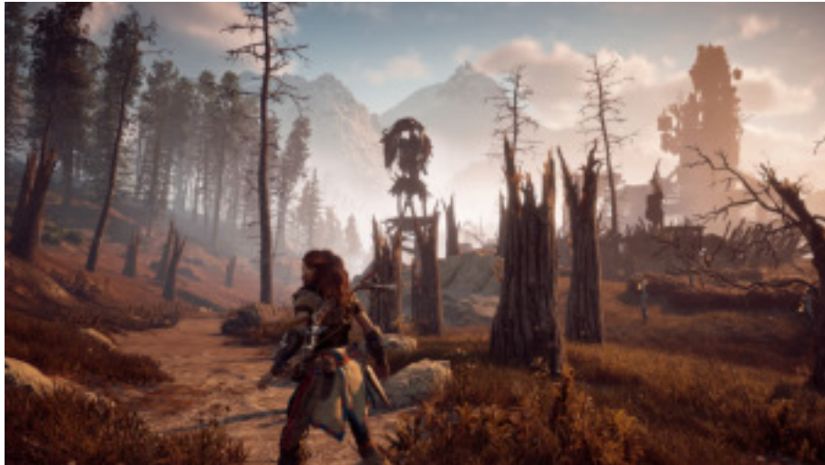
Figure 7: Bandit Camps and man's overexploitation of nature in Horizon Zero Dawn.

Open world gameplay in particular consists of several different rhythms in variable sets. Quests dominate for a while but can mostly be paused for free roaming . Depending on the quality of world design, the placement of quests ( striated mode of play) and the possibilities of smooth appropriation of space, open world gameplay can be a harmonious accumulation of rhythms – a polyrhythm (Lefebvre 2014, 25).