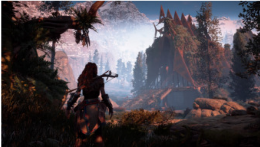
Figure 6: Walter Netsch’s iconic U.S.A.F. Cadet Chapel (Colorado Springs) as landmark of a bygone Colorado and as Corruption Zone in Horizon Zero Dawn .

prospect and refuge spaces, climbing paths, stealth inducing high grass (a space of prospect and refuge) and different combinations of hostile NPCs. Such variability of cyclical repetitions and their digital modularity indicate the potential of a smooth appropriation of the striated wilderness . They are “possibility spaces” in the sense of Jenkins and Squire (2002, 70) that allow an ambiguous play pattern. 5 Consequently, a rhythm’s quality depends on the variability of its repetitions.