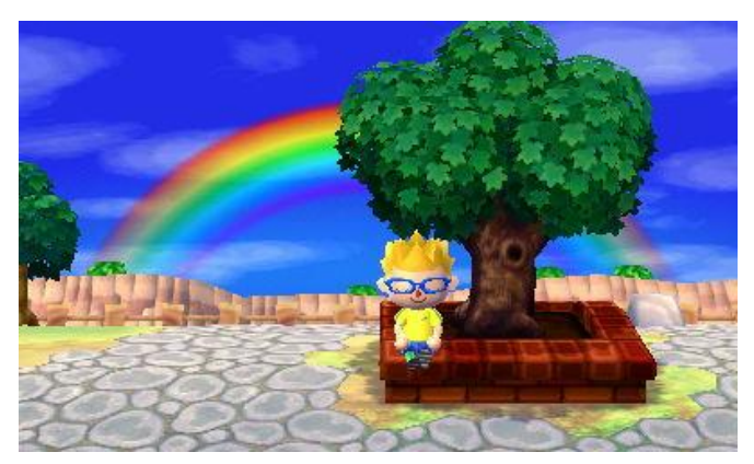
Fig. 7 - The player seated by their town tree. The camera has panned upwards and to the left to allow space for the credits to appear if the player waits for long enough.

When coupled with design choices that discourage running as well as a narrative focus on small-town life, these two vignettes become expressions of the game's openness to unproductive inaction. Despite the fact that the player could be paying off their debt, collecting more bugs and fish for the museum, or even performing the emotional labour of befriending villagers, they instead find respite in a moment of stillness. In the same way that it might be argued that the very act of play, when unfettered from financial incentives, acts as a slow life-esque disruption of everyday capitalist rhythms, so too do these examples allow the player to take shelter from even those pressures of a consumption-based society that are built in to the game.