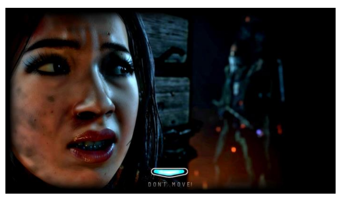
Fig. 1 - The player character (left) holds still in the hopes that the figure wielding a flamethrower (right) passes her by.

In Supermassive Games' Until Dawn (2015), players control a group of teenagers as they walk through various environments and horror movie tropes jump out at them from the shadows. Much of the gameplay is made up of branching narrative paths that correspond to dialogue choices and other decisions that the player makes, but there are also numerous action sequences that a player can succeed or fail at based on their ability to execute particular controller inputs within an allotted timeframe. The most notable of these for our purposes is Until Dawn 's unique 'Don't Move!' prompt (Fig. 1).