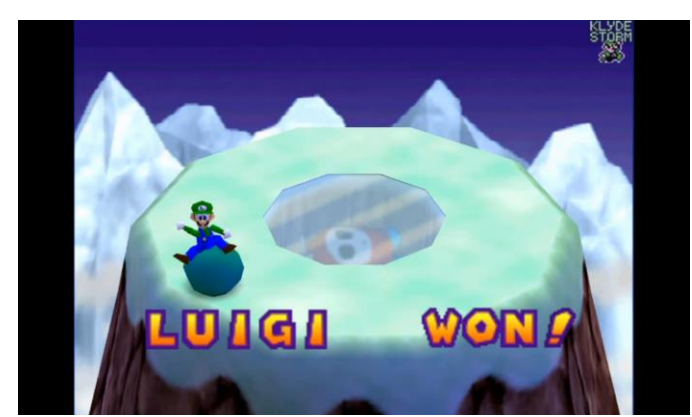
Fig. 5 - The victory screen for the Bumper Balls minigame. Luigi started in this spot and did not move while the AI-controlled opponents still managed to lose.

Nintendo's Mario Party series is undeniably better known than Man vs Wild . Players select from a cast of regulars from the Mario Bros. canon and take part in a boardgame-style battle to collect coins and stars by winning minigames that range from tug-of-wars to pizza-eating contests. Nearly ten years after the release of Mario Party 2 (1999), a YouTuber known as KlydeStorm uploaded a video called "Mario Party 2: Luigi wins by doing absolutely nothing" (KlydeStorm). In the video, KlydeStorm plays of a selection of minigames in which, as the title suggests, the player-controlled character (Luigi) is able to win against three 'easy' level AI opponents without any button inputs being made. In the video, the AI players are shown to act seemingly at random, in one instance throwing themselves off of a mountaintop with no interference from the player character (Fig. 5).