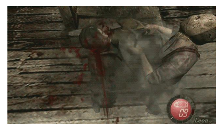
Fig. 2 - The player character (Leon) in a state of middecapitation. The camera angle has changed from behind the player's shoulder to better show off the effort put into animating the scene.

As is the case in Until Dawn , in RE4 , the player is engaged in keeping their character alive while dealing with various horrors. RE4 's graphic death cutscenes place the player in a state of stasis through being apocryphal disruptions of the canonical plot since, if Leon dies, the player must play the encounter over again until they 'get it right'. Although many games have player death as a mechanic, an interesting feature to RE4 for our purposes is that the amount of effort put into rendering these over-the-top death scenes performs a dual movement of forcing the player to sit and watch the result of their failure while simultaneously making that failure feel less severe by offering up the gruesome cutscene as a 'reward' of sorts.