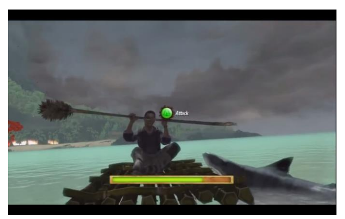
Fig. 3 -Bear Grylls sits on his raft unimpressed despite the dangers that surround him.

survive even Earth's deadliest places. In the game, players take control of Bear and do much the same, however the fact that it is a game allows the survival situations to tread into hyperbolic territory. One such instance that pushes the bounds of believability has the player control Bear as he builds a raft and paddles away from a deserted island while a volcano erupts in the background. A bar at the bottom of the screen depletes almost comically slowly, denoting how long the player has to escape. As one begins to paddle away, a shark attacks the raft for unknown reasons and a quick time prompt appears allowing players to fight the shark with an oar (Fig. 3).