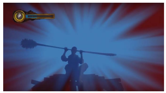
Fig. 4 - Bear Grylls, still fused to the raft and still unimpressed, sinks to a watery grave. Note that his sprite has not moved at all.

It was in this context that, during a Let's Play, a pair of YouTubers that are known as the Two Best Friends, decided to let the timer run out since, in their words, it was quite likely that "no one on the Internet has done this yet" (Super Best Friends Play). Instead of responding to the game's prompts, the two sat and watched the timer run out while the shark's short raft-gnawing animation looped for what ended up being so long a wait that they cut much of it out of the final video. Once the timer did finally run out, the raft, with Bear attached to it, flipped over in one clunky movement completely devoid of animation and the game reset the players to the last checkpoint (Fig. 4). After a great deal of laughter, one of them remarks, "They did not spend time on that..." (Ibid). This apparent oversight on the part of Scientifically Proven would not have come to light had the Two Best Friends not wanted to 'see what happens' when stasis is applied in unintended ways.