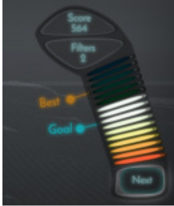
Figure 3: The score widget of Binary Fission . The bar on the right fills up as a player’s score increases. The teal Goal marker shows on the bar a baseline number of points a player must achieve to ‘score’ the problem. The orange Best marker on the bar shows what the current overall high score for that problem is. The Next button is not shown until the player’s current score is greater than or equal to the goal score