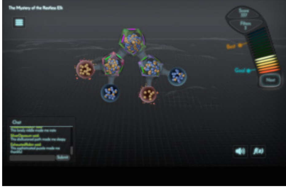
Figure 1: The general game play screen. Players create decision trees that sort the quarks into a blue pile and an orange pile