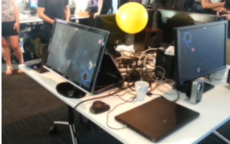
Figure 2: A Where's My Spaceship setup. Four screens facing perpendicular around a square and with space to circumnavigate.

Where's My Spaceship is a four screen competitive multiplayer game installation. Players pilot a spaceship using a wireless controller with the goal to mine and pirate asteroids and return them to their base. Each screen faces outward and perpendicular to its neighbors and represents a different quadrant of space. These quadrants are connected only through wormholes. Players navigate to the other quadrants by travelling through wormholes. When players take a wormhole, they are randomly teleported to another quadrant and as these quadrants are screens spaced apart they need to physically move around to locate the ship. Players use a grappling hook to grab onto the asteroids which are generated on three of the four screens. Players can choose to stay at the base, located on the fourth screen, in order to pirate the asteroids of those attempting to return with asteroids. Whichever player manages to drop the asteroid in their color coded section of the base scores the points.