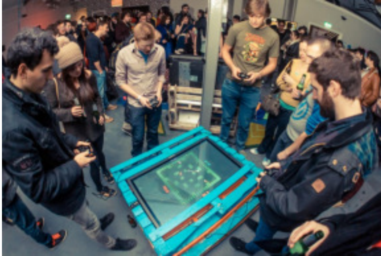
Figure 4: At exhibition at Wild Rumpus #5, Turnover in a custom splintercade 4 .

proved the biggest barrier to setting up and playing these games. As we operate in an inner-city university, space is scarce and space that might be available is usually saturated with desks or other equipment. Moving that equipment around, if possible, and then setting up installations only temporary is burdensome to play. “Starting the game” has a tangible form, much more than plugging in a controller and this creates friction.