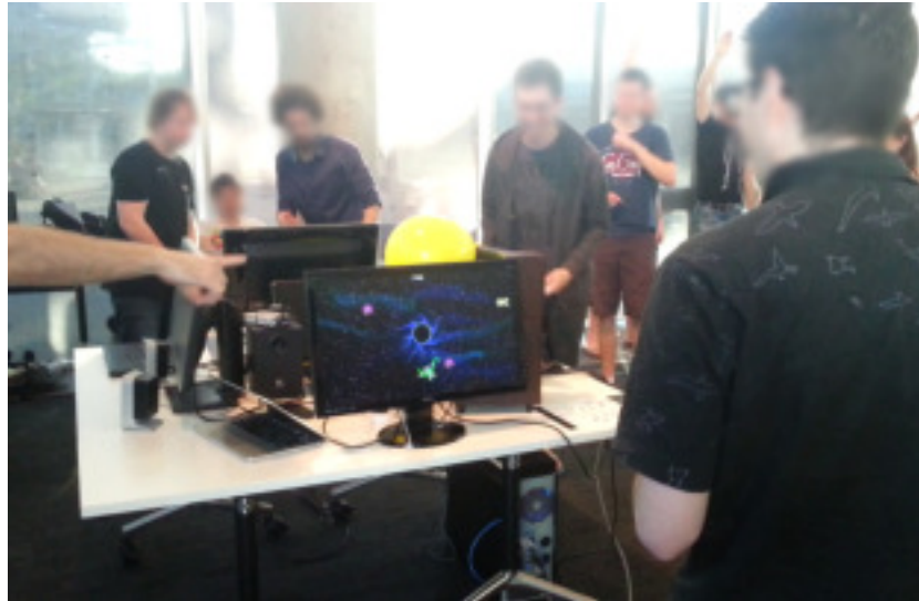
Figure 3: Spectators taking an active role in Where’s My Spaceship , pointing out activity and location to other players.

further created opportunities for horseplay or moments of intimacy, perhaps by bumping into other players on purpose and playfully shoving down their controllers. Furthermore, this coming and going of players would constantly allow players to re-evaluate who their threats were and who they might form micro-alliances with, potentially ‘limelighting’ players (Avedon 1971) by drawing attention to both their avatars or themselves. Where player’s avatars came together on one screen, so did the players themselves.