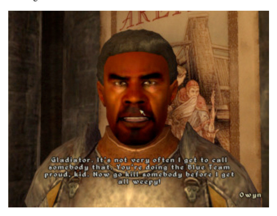
Figure 1: Oblivion had simple social feedback.

CRPG, Elder Scrolls IV: Oblivion (as well as its successor, Elder Scrolls: Skyrim ), has much to offer in the inter-relationship of world and player and it has further potential in the simulation and affordance of social interaction, communal identity and cultural learning.