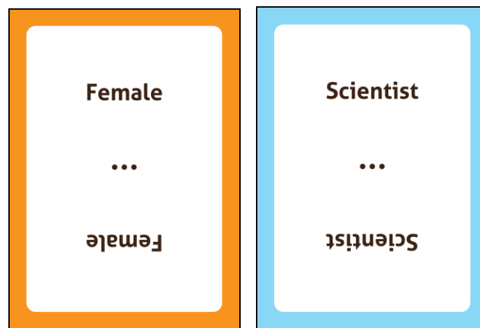
Figure 3: Sample card pairing from Buffalo: The Name Dropping Game .

a no-game control condition, exhibited significantly higher levels of social identity complexity (i.e., greater diversity and inclusiveness in their perception of their primary identity groups, which is a predictor of tolerance and egalitarianism: Roccas and Brewer 2002) and universal orientation (i.e., a measure of global non-prejudice: Phillips and Ziller 1997). Thus, despite (or, we would argue, because of ) players’ general failure to realize or recognize the game’s persuasive goals and mechanism, the game successfully shifts players’ conceptions of their own and others’ identities simply by virtue of playing the game and both offering and being exposed to a plethora of exemplars of cross-cutting identity groups and associated traits. Moreover, even in cases when players recognize how their own biases might have influenced their performance in the game (e.g., one playtest participant regretfully reflected on his and his group’s failure to name a “Hispanic lawyer,” despite the fact that Sonia Sotomayor had recently been appointed to the Supreme Court), they by and large do not realize that this was, in fact, a focal outcome intended by the game’s designers.