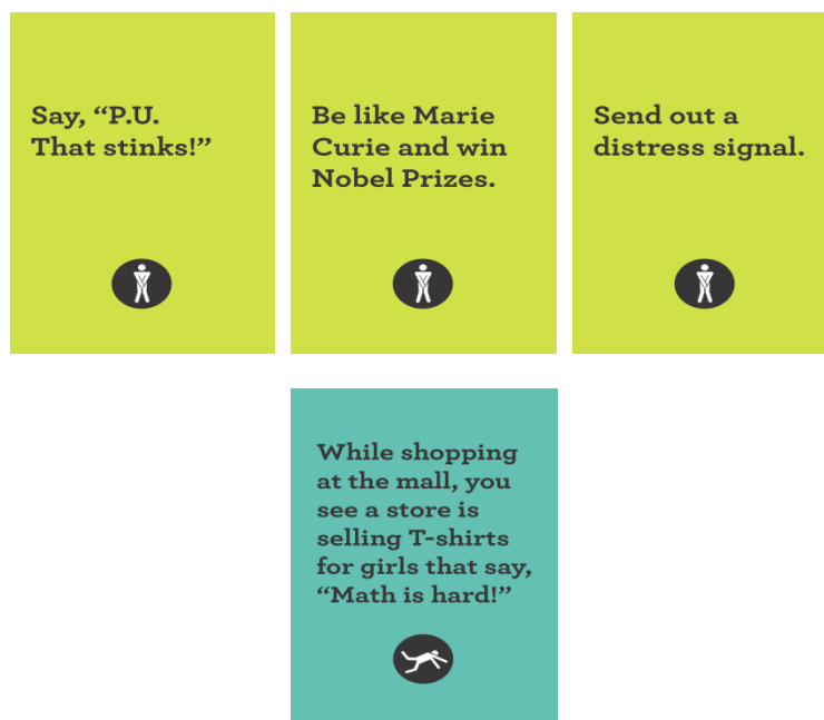
Figure 2: Sample Reaction Cards (green) and sample Moment Card (blue) from Awkward Moment .