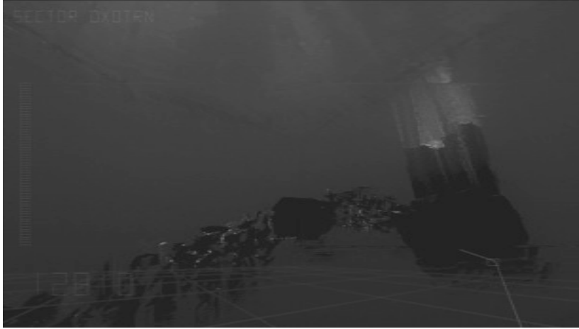
Figure 2. Datatragedy, Memory of a Broken Dimension , 2012.

One likely scenarios for the player unfamiliar with a command line OS is a Google search, which lead this author to Computer Hope: a not for profit IT help service. 3 A YouTube video of a player clearing the first stage is also available online. 4 Either method leaves us with an invocation of a particular facet of computer game history; that of online user-generated content providing information about the rules, controls, and strategies relevant to a specific game. Traveling from one context to another (from an IT help service to an emulated command line OS), I revisited inadequate memories of opening TIE Fighter (LucasArts 1994) through DOS on an Intel 486 at age 8. After clearing the DOS stage by entering the .exe files into the command line in the correct order, the player arrives in the main arena of the Memory demo: a 3D space where the move-look UI replaces the blinking text cursor.