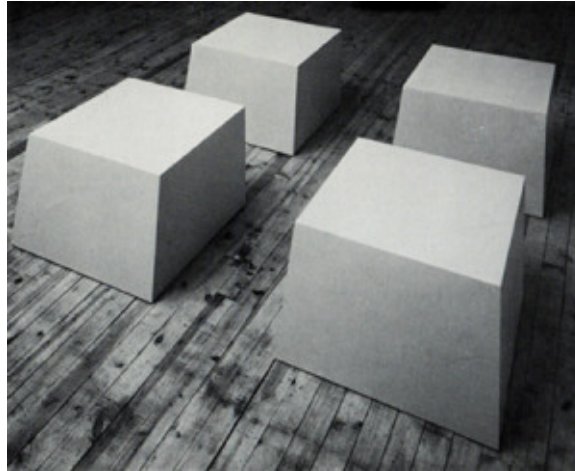
Figure 4. Robert Morris, Untitled , 1965.