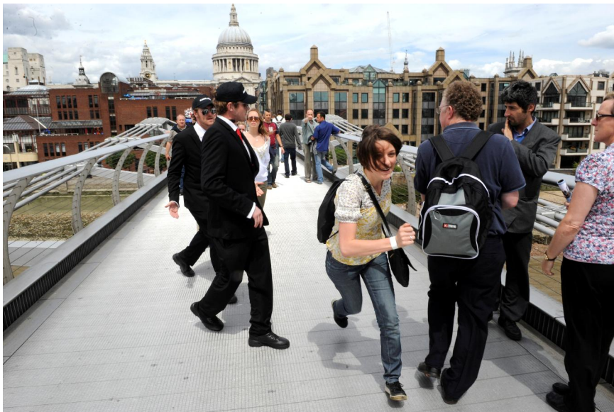
Image 1. Player escapes from the Blackwell Briggs security personnel on Millennium Bridge in London.

A particularly interesting aspect of CFG concerns the interplay between narrative and gameplay in conjunction with tiered participation (Dena, 2008). Almost all trans-medial productions make use of some kind of participant tiers, so that players are offered multiple entry routes and can choose their own level and style of participation. In comparison to most other ARGs, CFG had a particularly strong live play component, drawing upon the tradition of Nordic live action role-playing (Stenros & Montola, 2010, 2011). While online play followed the traditional ARG model of crowd-sourced, collective puzzle solving, the on-street players played in small groups and with a strong focus on interacting with the environment. CFG put the players on the streets, making them solve puzzles, dodge security guards and interact with hired actors, thus much more resembling the activities that you would expect in a computer game, only in the physical world (see Image 1). Our analysis shows that for multiple reasons, the live participation tier became distanced both from the overall storyline and online play.