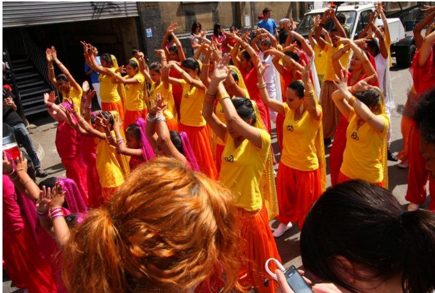
Image 5. At the second live event a Bollywood flash dance mob performed to distract the bad guys enabling the unmembers to sneak into their new headquarters.

It seems that players who attended street games expected to be doing thrilling things for real, while the online players reported no such disappointment. However, there was also a marked difference in aesthetics between online content and live events. The online campaign featured serious themes and a high level of reality-fiction blur. The aesthetics of live events were based on playfulness, exemplified by a Bollywood flash dance mob distracting guards during the second event (see Image 5). The playful style of the live events was not a coincidence, but a deliberate design aiming to create a sense of safety, as well as to avoid scaring an outside audience. (For the problems related to outsider experiences in pervasive games see Montola et al., 2009). However, the trade-off is diluting the thrill of the experience.