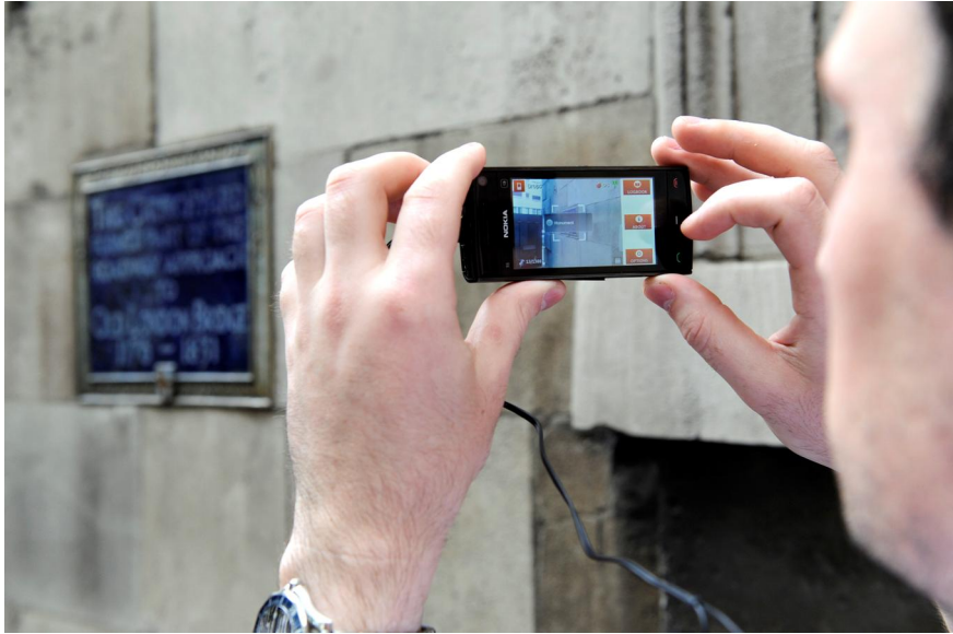
Image 2. Nokia Point & Find in use.

into online webisodes that would communicate the progression to players who could not make it to the event. They also served as advertisements for upcoming events.