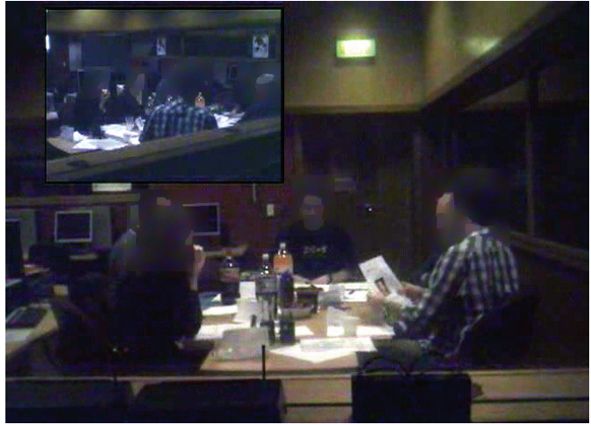
Figure 1: Players involved in a PnP RPG game. Cameras are placed outside the gaming room behind one-way mirrors to minimize interference.

The game sessions were recorded on video and audio, and logs extracted of the in-game chat in the CRPG sessions. Before and after each game session, the players were asked a series of questions in questionnaire format. After each session the participants completed the Response Questionnaire as well as other questionnaires not utilized in this paper. The player groups were also interviewed about their experiences during game session, which was discussed among the participants and the investigators.