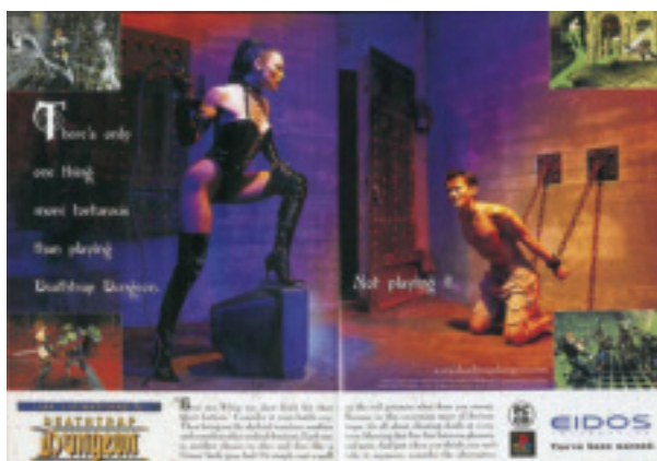
Figure 6: Examples of video magazine game advertisements.

Representation of women is symptomatic of a much larger problem: the games themselves are unwelcoming to those not considered “gamers.” Indeed in many respects the digital playground is shut off to “minority” players entirely, whether in terms of game creation, game technologies, or game play, whether merely in terms of creating domains that are exclusively male, or through discriminating or alienating practices of players themselves.