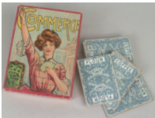
Figure 3: Commerce (Ottoman & Lith 1900)

While the people represented on the boxes of these games were generally white and middle class, they spanned both genders and a wider range of ages than do typical video game packaging and ads of today. The convention of showing people playing the game used on the packaging of the period provides some insight into the way in which the “technology” of the board games influenced their players and their role in society. The Sociable Telephone—A Game for the Smart Set , designed to teach etiquette for the new communications technology, features a smiling Victorian lady (Parker Bros. 1902); and the box cover for the stock market game Commerce shows a woman holding a trading card high up in the air. (J. Ottoman & Lith 1900) (Figure 3) Ads for Pillow-Dex , an indoor sport utilizing a kind of balloon, show Victorian ladies in full regalia knocking the object into the air. (Parker Bros. 1897) [18] (Figure 4) While there are currently no videogames based on women’s sports, the board game industry of over 100 years ago, in recognition of the game’s popularity among both men and women, created The Game of Basket Ball with an all-female cast. (Chaffee & Selchow & McLoughlin Bros. 1898) [8]