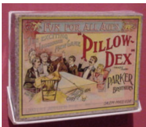
Figure 4: Typical of packaging of the day, Pillow-Dex shows multiple generations enjoying the game.

One of the most intriguing and little-known aspects of the early board game industry was the predominance of women in the production process. The following account, from The Game-Makers , a history of Parker Brothers, sets the stage for what would come to be called “The Pastime Girls,” after Pastime Puzzles, the jigsaw division of the company [18]: