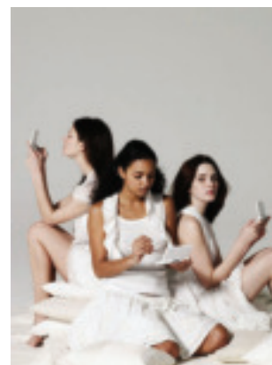
Figure 7: A French ad campaign for the DS Lite.

While at this particular historical moment, the Hegemony of Play is the dominant force in the cultural production of games, we are beginning to see signs of subtle but tectonic shifts. This paper was written on the heels of the console frenzy of Christmas 2006, also at a time when the Internet has afforded an alternative distribution channel whose impact is only beginning to be understood. Sony and Microsoft placed their bets on the fervent loyalty of “gamers” in search of higher polygon counts of the same fare with their Playstation 3 and Xbox 360 respectively. the number 3 console maker is staging a quiet revolution. Few paid notice to the re-branding of the “Gameboy” to the “DS” that took place in 2004. Yet advertising campaigns, in addition to the name-change, showed Nintendo setting its sights on a new population of players. (Figure 7) With the release of its new Wii console system,, Nintendo has stated openly and unabashedly, and demonstrated with both its new product development efforts and advertising campaigns, that it intends to diverge from the “path of least resistance” and follow in the footsteps of George Parker to return game-playing to a more inclusive activity that embraces diverse interests and embraces the whole family.