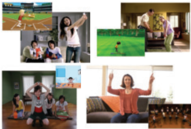
Figure 7: Assorted pre-release ads for the Nintendo Wii.

advertising campaigns harkening back to board game packaging of old show a diverse array of players engaging primarily with each other, rather than screenshots showing off graphics, as is the common practice with other systems. (Figure 7) Nintendo, once the undisputed giant of the game industry, has turned its back seat position in the Hegemony of Play into an asset. Rather than racing to create the fanciest graphics with the same old game mechanics, Nintendo has bet on new audiences and accessible game play, cultivating an audience of girls, women, adults and Baby Boomers, in other words, everyone except the “gamer” demographic described above.