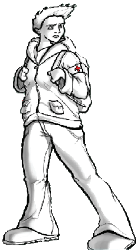
Figure 6: Re “Dox” – the final draft

Appealing yet again for a strong engaging and non-stereotyped female street doctor, we got, finally, in this third draft, a young woman with a hip, metropolitan look, now more wary than terrified, who is a bit more welcoming as a character. Note that in this final draft she has a somewhat androgynous look to her.