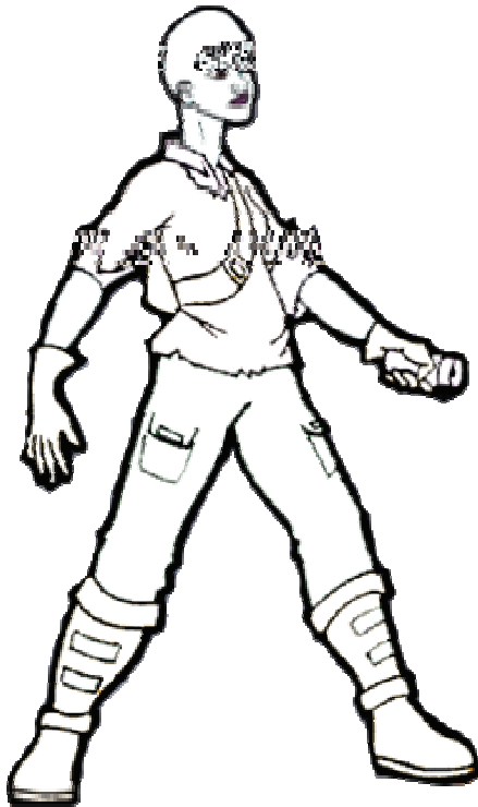
Figure 3: Second draft of “Dox”

The second was a stronger character, but rendered without hair, and looking very much like a victim of contagious disease herself.