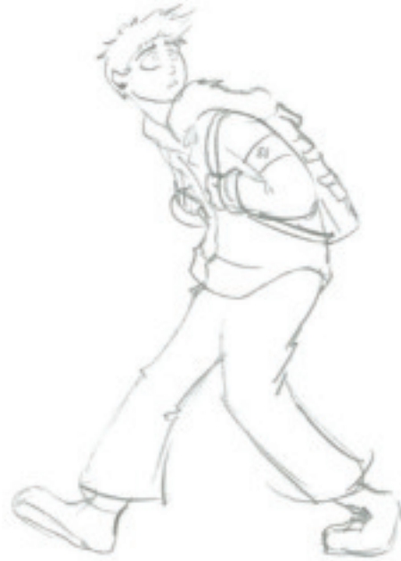
Figure 4: Third draft of “Dox”

And the third, when we asked for a more likeable character, one a young player might want to “be,” was rendered as a slight, visibly fearful, character likely to inspire pity and protection for her vulnerability, rather than confidence in her skill and courage. The contrast is marked in relation to her strong, savvy, streetwise male counterpart.