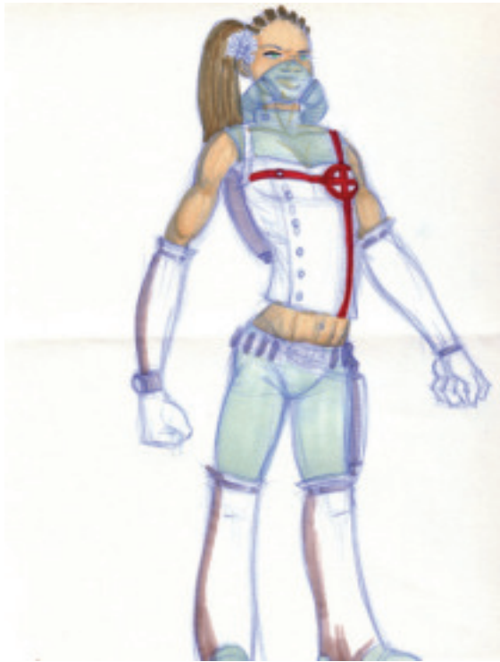
Figure 2: First draft of “Dox”

The second was a stronger character, but rendered without hair, and looking very much like a victim of contagious disease herself.