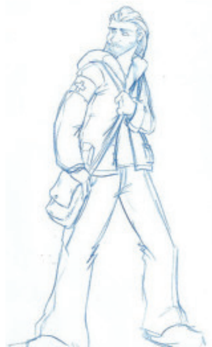
Figure 5: The male “Dox”