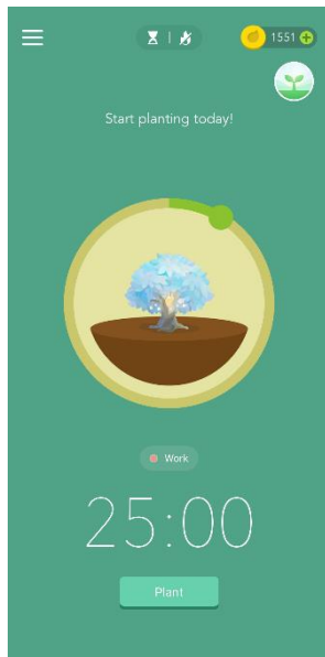
Figure 1: Forest timer

Gamification affordances in Forest and Hold include rewards, points, coins, achievements, badges, leaderboard, levels, and progress. They also include affordances like timer, statistics, communities, notifications, and tagging. In particular, the affordance timer (see Figure 1, 2, and 3) is shared by all the apps and is one of the core gamification affordances. The timer represents a clear goal for users and their progress is quantified and visualized by a clock (and also an avatar in Forest ).