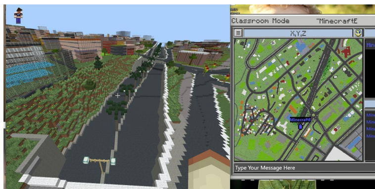
Figure 1: Recreation of an actual neighbourhood through Minecraft .

To design the workshops we carried out a literature review on gender, interculturality and sustainability issues in the context of urban design (Sève et al., 2021), the notion of playfulness and its pedagogical basis (Sicart, 2014; Flanagan, 2015; Johnston et al., 2022), and co-creation methodologies using games (Acharya & Wardrip-Fruin, 2019; Myers, 2019). Also, we designed a card game and promoted the implementation of urban spaces on Minecraft (Figure 1) that recreated the areas we would work on.