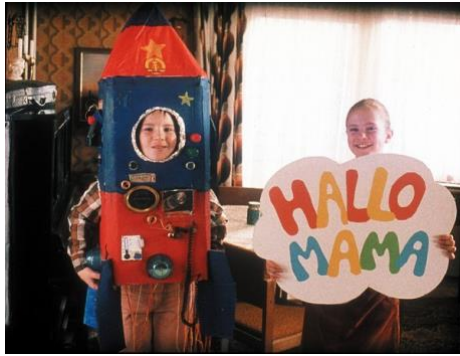
Figure 1: The epitome of nostalgic representations of post-communist societies, the film Good Bye, Lenin! (Becker, 2003) explores almost every manifestation of Ostalgie .

The conquest of space motif did not disappear either inside or outside the political, mythological, and popular culture spaces of modern Russia 6 . What was once the promise of an achievable heaven on Earth—from the first space flights to the later abstract notion of the utopia manifested in sci-fi literature (Kohonen, 2011)—has now found a comfortable home in the indie video game scene. Proof of this trend and objects of this analysis are the games Lifeless Planet: Premier Edition (Stage 2 Studios, 2014), Little Orpheus (The Chinese Room, 2022), The Great Perhaps (Caligari Games, 2019), and the VR series Red Matter and Red Matter 2 (Vertical Robot, 2018; 2022).