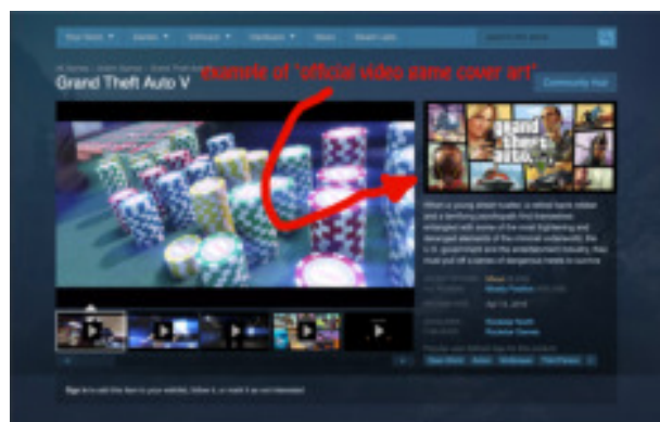
Figure 1: Example of what we identify as a digital “cover” within the Steam digital storefront.

In this paper, we provide two primary insights from analyzing 298 responses to a survey about impressions of video game covers. Firstly, in complementary findings to those by scholars such as Passmore et al. (2018), we describe how all participants perceived the general diversity of sampled covers of top-selling games to be inadequate. Secondly, we describe how the impressions and experiences of white participants and participants of color differed significantly in relation to topics of self-representation and the value of representation on covers. Our primary contribution expands the empirical understanding of how a lack of diverse representation in games and on their covers disproportionately impacts people of color. More specifically, our findings can help designers and researchers alike better account for how player interaction begins before game software is purchased, installed, or accessed.