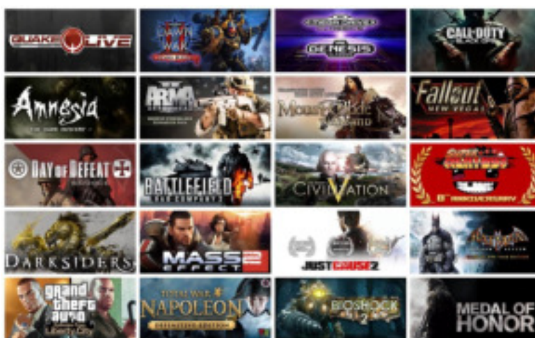
Figure 2: Created cover compilation of the top 20 best-selling video games on Steam in 2010, based on Steam250 data.