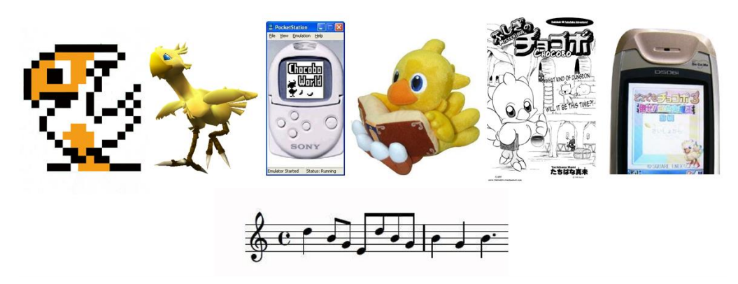
Fig 2: Cross-media instances of the Chocobo character united by a single, parsimonious leitmotif.

Lastly, we can tentatively identify a tenth, intertextual function: Leitmotif as supporting transmedial world-building. Leitmotifs from Final Fantasy VII can be heard in spin-off media such as the prequel game Crisis Core (Square Enix, 2007) or the anime film Last Order (Asaka, 2005). But it is the series' enduring "Chocobo" leitmotif that stands as the clearest indicator of how music can carry meaning beyond the bounds of its original instalment. Debuting in Final Fantasy II (Square, 1988), the Chocobo theme/leitmotif (Fig. 2, bottom) has doubtless contributed to the mascot's popularity, as evidenced by Chocobo-related media ranging from manga (Fig. 2, second from right) to keitai games (Fig 2, right). Owing to deep familiarity engendered by repeated exposure and positive associations, the character's cheerful leitmotif is liable to spring to mind even when fans are enjoying Choco-media with no auditory component. On these bases, I suggest in closing that memorable musical leitmotifs can play a subtle yet significant role in the cross-media phenomena referenced by this year's conference's theme, "the Emerging Ludo Mix".