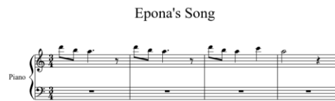
Fig 1: The in-game tabulation of Epona's Song (left) features its motif—a fragmentary musical idea—played twice. The score (right) repeats the motif a third time: The four-bar phrase—a more complete musical idea—is resolved with two additional notes. Both the fragment and the more complete musical idea are instances of leitmotif.