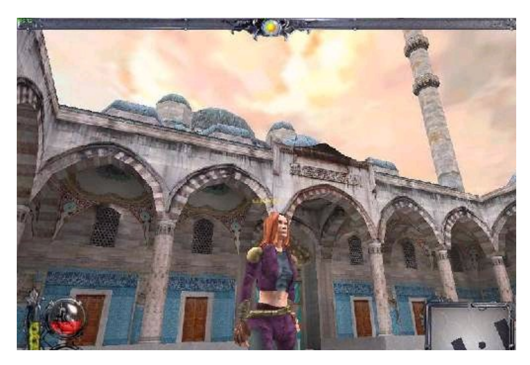
Figure 4: Screenshot from Istanbul MMO game

Turkey. Yogurt technologies, Cinemedia and 3TE Games published their first game "Pusu" (ambush) in May 2005. In this TPS (Third Person Shooter) game a Turkish boy fights against bad guys. It is also reported that Yogurt and 3TE have started another game project. Another professional game that will be sold in International market in this year is "Culpa Innata" by Momentum-DMT. In this adventure game they use some of their patent-pending technologies in 3D face-modeling, animation and lip synchronization. Kabus22 (Nightmare 22) is another title in which developers work hard to finish in this year. Besides those professional games there are many amateur or semi-professional ones. Some of them have few hundred fans. For example open beta version of "Mount&Blade" a game which is prepared by two independent Turkish game developers sold nearly 1000 copies. It is supposed to reach more gamers when completed. Mobile gaming is gaining popularity among Turkish game developers. In May 2005, FunPac a mobile game company in Turkey, succeeded to sell more than 150.000 copies of XR-Jet Ski game.