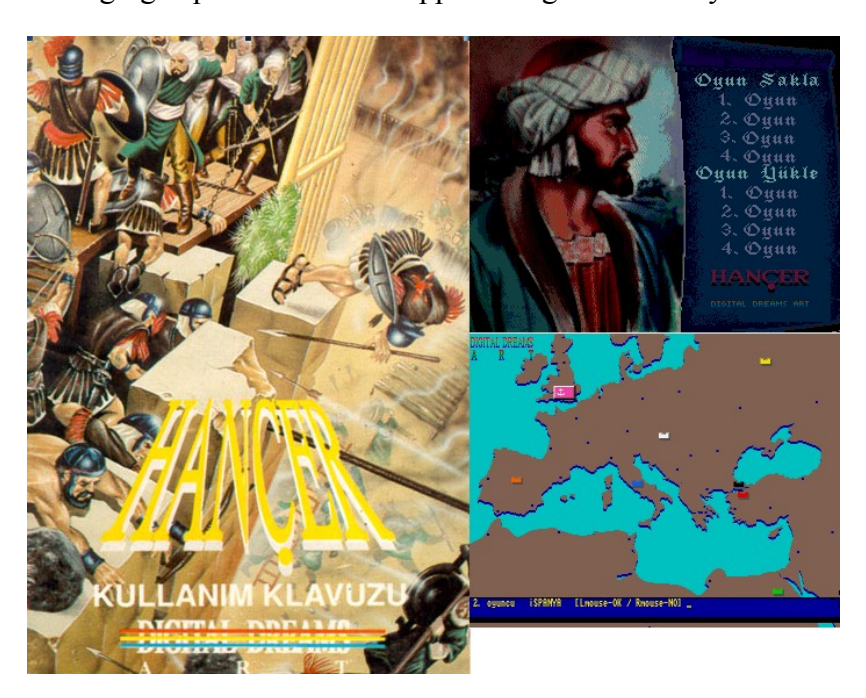
Figure 1: Cover Illustration and Screenshots from "The Dagger".

In 1990, he organized APUC (Amiga Professional Users Club) with 450 members. Producing a Turkish strategy game was one of most outstanding project ideas. In November 1990, he completed the scenario of this game and shared the idea with club members. Many people ranging from professional graphics artists to historians supported this project. They paid attention for details including important historical events, accessories of medieval age, child physiology etc. Many academicians including educators consulted them. Before the release of the game, they advertised it in a local Amiga magazine. One of the most interesting parts of this story is the preparation phase of game diskettes. There were 3 diskettes in one set and copying one diskette requires approximately 3.5 minutes plus some extra time for verification. Volunteer APUC members with external floppy drives helped them to overcome this production problem. After a year of hard work the game was ready for release in 1992. In early 1990s, software piracy was quite rampant. Original boxed game sales were around 300 for good Amiga titles. The Dagger sold more than 2200 original copies in 2 years. The price was US$ 15. Development cost of one set was US$ 7. If we consider the share of game markets, it is clear that these figures are far away from encouraging capital owners to support the game industry.