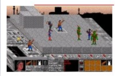
Figure 3: Legends of Istanbul: Left: Amiga Poster, Center: PC Version Front Cover, Right: Screenshot of the game