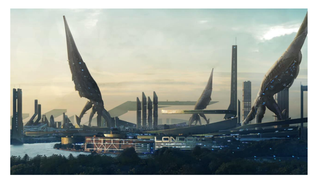
Figure 1: Three Reapers attack London in Mass Effect 3 .