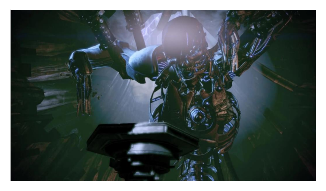
Figure 2: The reveal of the Human-Reaper larva in a Mass Effect 2 cutscene.

assistants. But while the geth are typically human-sized, the Reapers pose a threat that is far more sublime. In length, they measure anywhere from a few hundred metres to over two kilometres, dwarfing the peoples and cities they attack (Figure 1).