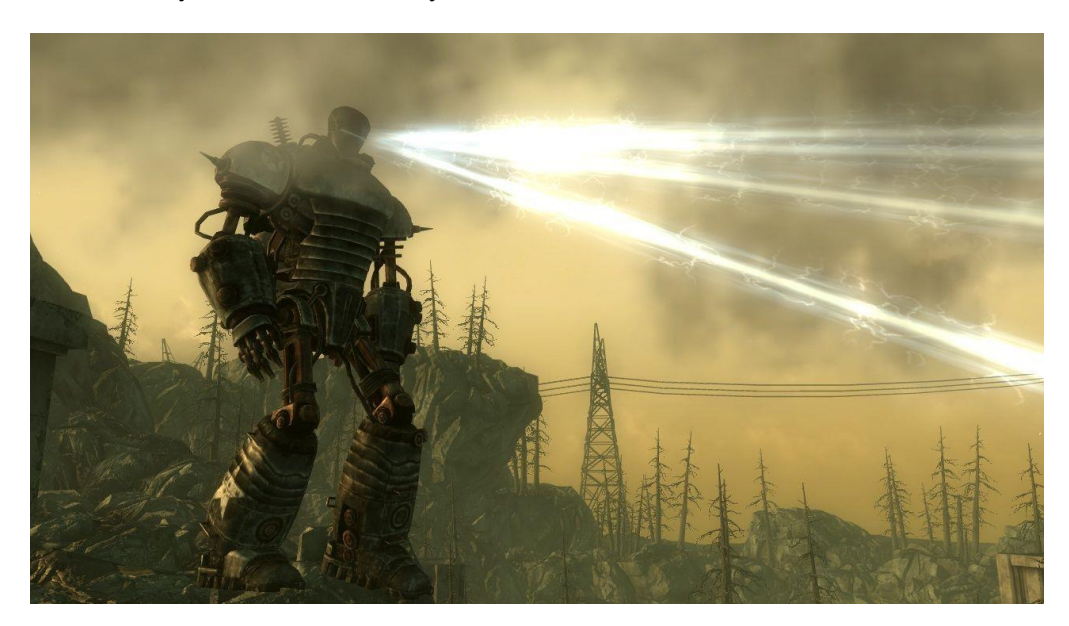
Figure 4: Liberty Prime in Fallout 3 .

considering how the giant plays a role within this ironic, satirical, nostalgic retrofuture paradigm through one of the most recognisable and humorous figures of Fallout 3 and 4: the all-American, democracy-loving, communist-hating, Chinese-destroying giant robot, Liberty Prime. "I am Liberty Prime. I am... America", he declares in Fallout 4 .<sup>2</sup>