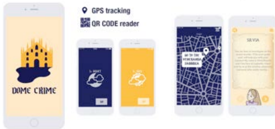
Figure 3: Screenshots from the prototype of the location-based mobile game Dome Crime .

a rich woman; Biagio, a marble carrier; Venturina, an orphan; Giorgio, the Deputy; Silvia, a young helper. The gameplay uses distributed and geo-localized narratives containing what allows to progress in the story and in the game. To find such clues and information, players need to visit several spots in the surroundings of the Dome. The story and its ending follow a multi-linear structure inspired by Clue (Jonathan Lynn 1985). As a matter of fact, the storytelling doesn't end up in a determined way, but it opens multiple possibilities to the audience who decides how to proceed, thus winking at possible other developments in terms of further stories set in the same storyworld.