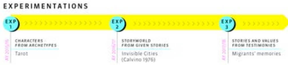
Figure 1: The three starting points adopted to design interactive narratives.

Transversally to the three experimentations, we asked designers in training to look at characters as repositories of stories able to activate the understanding of their inner meanings, suggesting further possibilities and knowledge. Building characters means crafting a set of potential stories, aiming at engaging the audience and further: it means empowering audiences with the possibility to act and express themselves, becoming active agents within the fictional world and its storylines. Focusing in particular on the games, outputs of the courses, such an intent turned to be as challenging and provocative as stimulating. Relying on the insights from our qualitative analyses, such games will be explored focusing on how the methodology and design processes (tools and methods) proposed contributed in developing their projects.