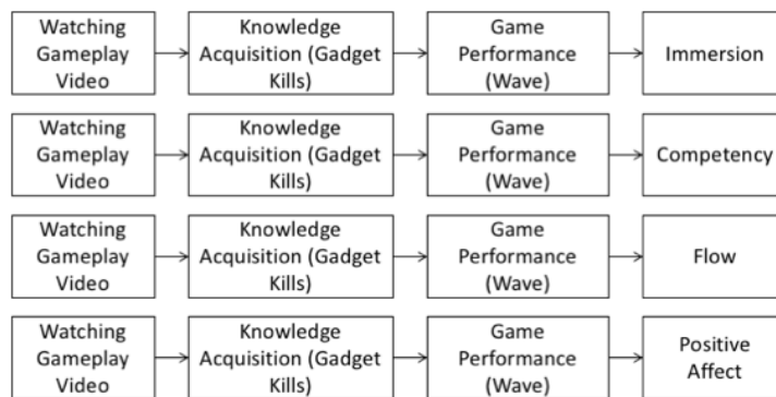
Figure 3: Illustration of significant indirect effects.

We also tested mediation models to examine the indirect effects of exposure to a demonstration video on the 7 aspects of the gaming experience in the GEQ via its effect on the observational learning of knowledge (as indicated by the number of Gadget Kills) and game performance (as indicated by the number of Waves). The results indicated significant indirect effects of exposure to a gameplay video on immersion through knowledge acquisition and thereafter on game performance— B = .11 , SE = .06 , Lower Limit of Confidence Interval (LLCI) = .04, Upper Limit of Confidence Interval (ULCI) = .30. The results also indicated that the indirect effects of exposure to a gameplay video on competency through knowledge acquisition and then on game performance were significant— B = .25 , SE = .12 , LLCI = .09, ULCI = .57. Further, it was found that the indirect effects from exposure to a gameplay video on flow through knowledge acquisition and then game performance were also significant— B = .10 , SE = .06 , LLCI = .02, ULCI = .30. The indirect effects from exposure to a gameplay video on the positive affect through knowledge acquisition and then on game performance were found to be significant— B = .19 , SE = .08 , LLCI = .08, ULCI = .41. Tests of similar mediation models on tension, challenge, and negative affect did not reveal any significance. Figure 3 graphically illustrates the significant indirect effects.