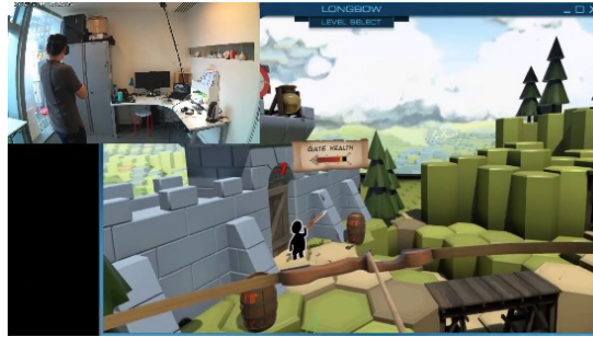
Figure 2: Screenshot of the gameplay video showing the use of a bomb (one of the gadgets) to kill an enemy.